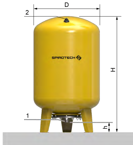
EVU10-120 .. EVU10-300