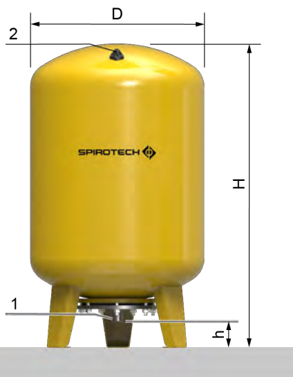
EVU10-120 .. EVU10-300